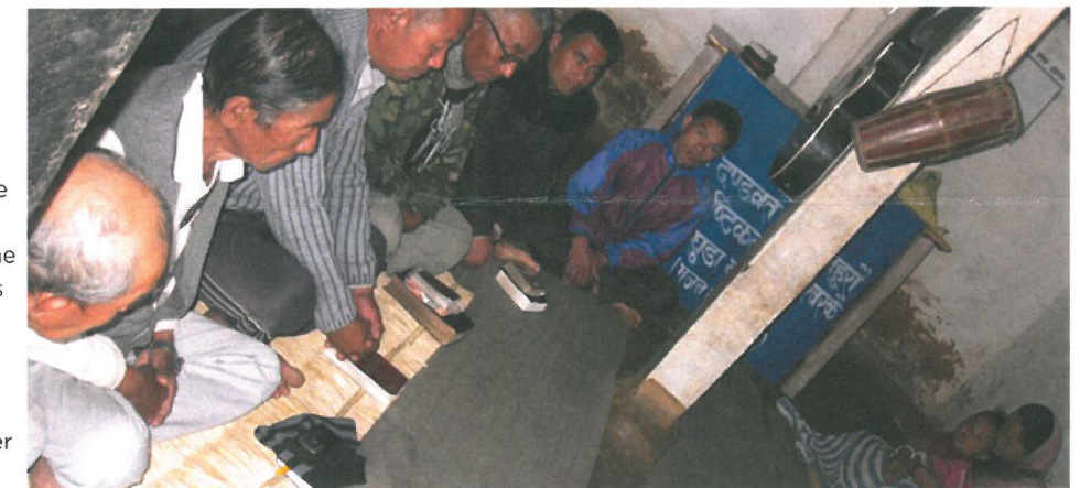
Branchu people listen to recordings of God's Word in their heart language

"After that, my life slowly changed. My brothers and other villagers saw the changes and persecuted me for my faith, but I didn't care what they said about me or did to me. Today, there is a church in my village and those who once persecuted me are now leaders in the church. I am so happy to see Yew Bible translation happening."